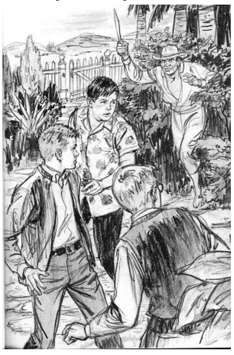
The boys stood paralysed on the walk as the man advanced