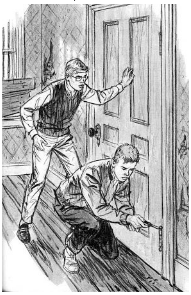
"Oh, yes, we do." Pete pulled out his heavy scout knife

"But we don't have any tools," Bob said.